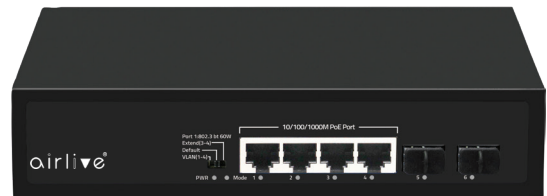
POE-GSH402 BT series